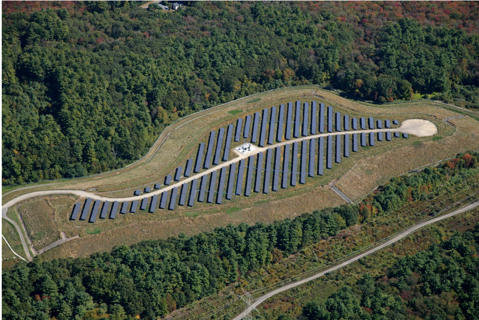
Easton Landfill 1,856 kWdc – Easton, MA